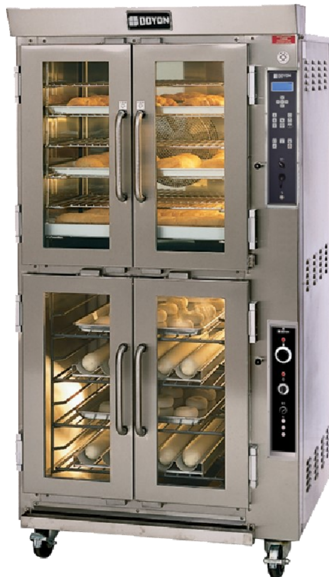
Jet Air Oven/Proofer Combination, Electric, Capacity (6) 18"x26" Pans, Side Loading, Steam Injection, Reversing Fan System, Digital Temperature Control and Timer, (9) Pan Proofer with Auto Water Fill, Glass Doors, Stainless Steel Construction, Casters, cETLus, NSF